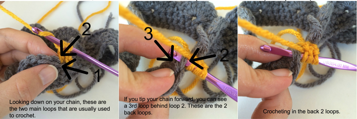
Row 4: Join second color (I used gold) to last sl st stitch of the last row. Chain 3. For the next 3 stitches (inserting in the back 2 loops of each chain only) you will do in each stitch, but keep the last loop of the stitch on the hook until you have completed the 3 do

Note: for row 4 and 6, stitch in the back 2 loops of the stitch (see photo).