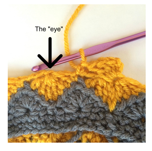
Row 6: (remember we are working in the back 2 loops of the stitch for this row) Join your main color (mine is grey) at the top of the diamond where you just