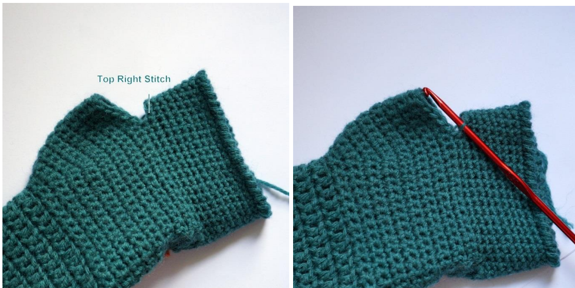
Figures 8 and 9