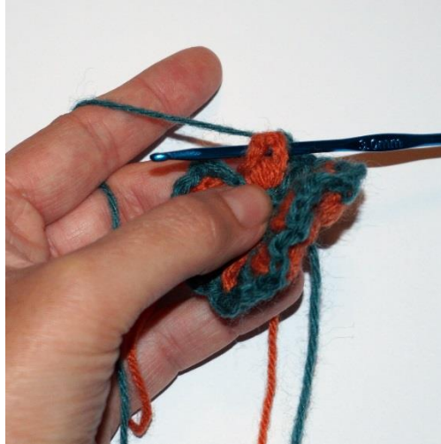
Figures 1 - 4