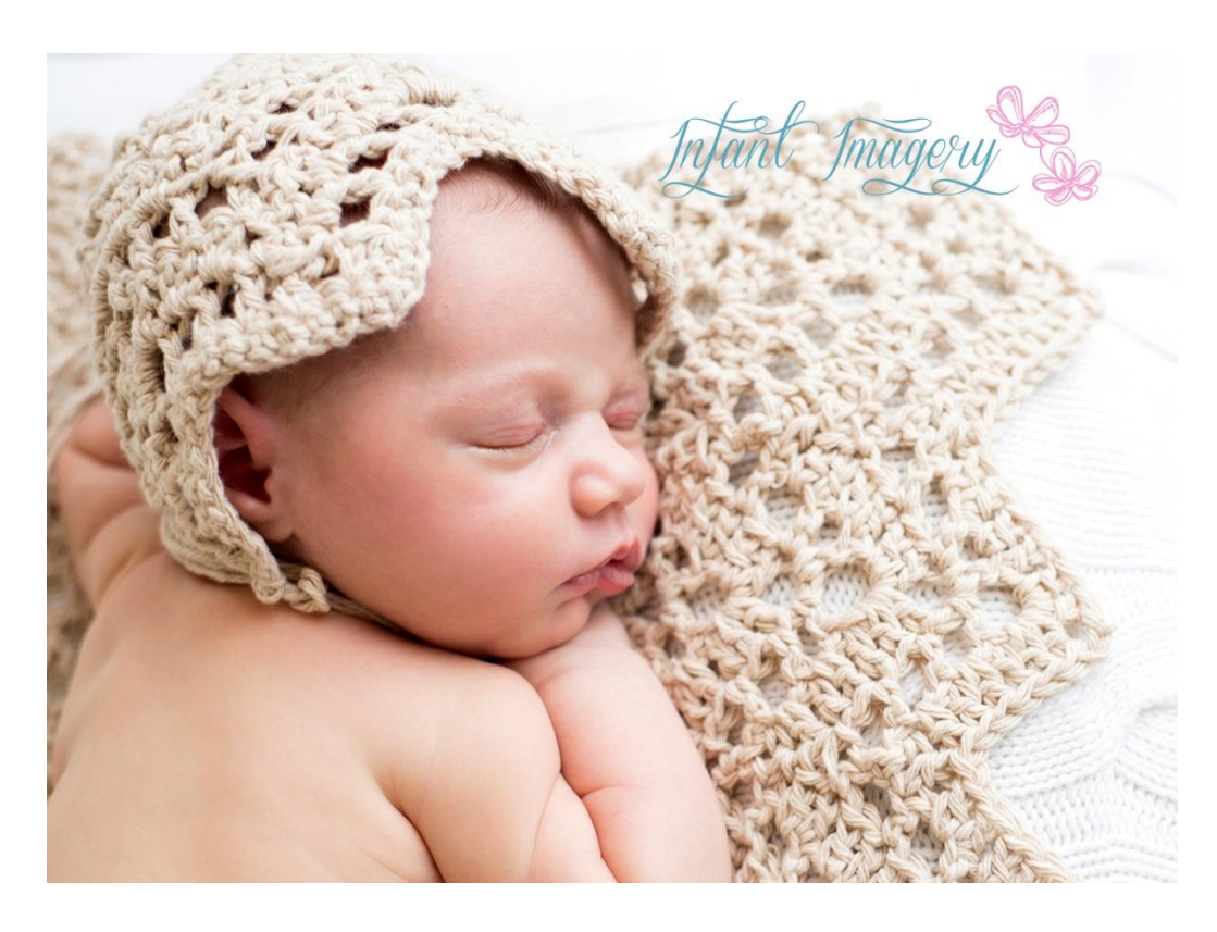
1 - @MelodysMakings