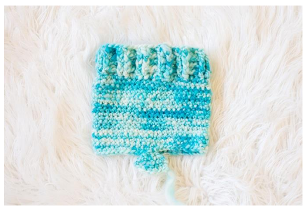
Photo 1 – Sample of what gusset will look like after creating 1 side. This is a crochet gusset, so it has no stitch holders.