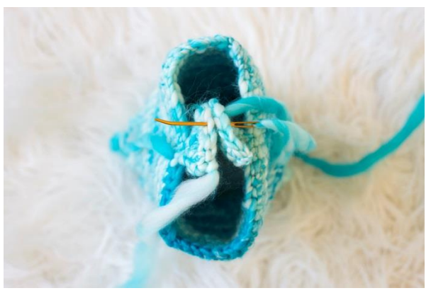
Photo 3 – Sample of seaming up the gusset. Work has been turned inside out at this point.