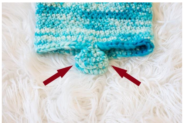
Photo 5 – Shows where to pick up extra sts. Pick up the extra sts from the edge of crotch gusset for each leg.