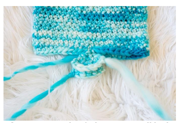
Photo 2 – Sample of what gusset will look like after creating both sides. This is a crochet gusset, so once again, no stitch holders.