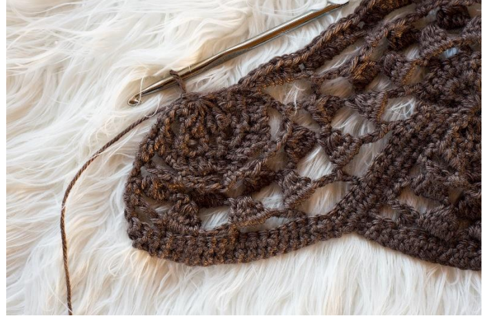
Photo 2: Beginning of repeat shell sequence. Join in a circle by slip stitching across.