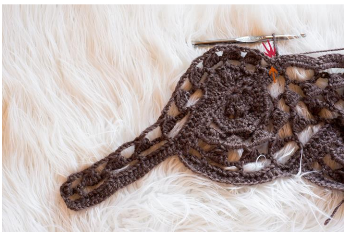
Photo 11: Row 4 Completed. Note the slip stitch into edge of prior shell (orange arrow), plus two more slip sts at end of row (red arrows).