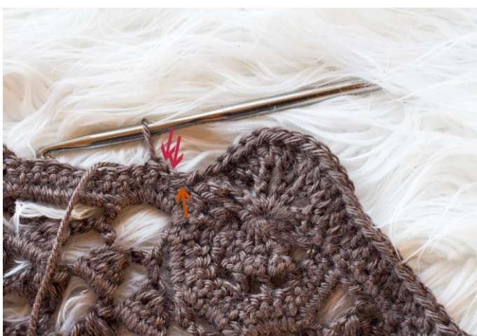
Photo 9: Sample of what slip sts at end of Row 2 should look like for "Repeat Shell Sequence Pattern." Orange arrow represents slip into edge of prior shell. Red arrows represent slip into next two sts which sub. as turning chain.