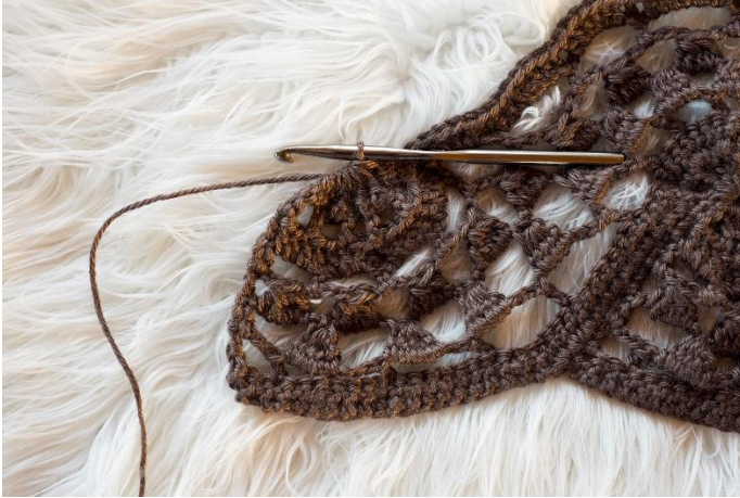
Photo 1: End of shell sequence after finishing the DC decrease worked over 6 sts.