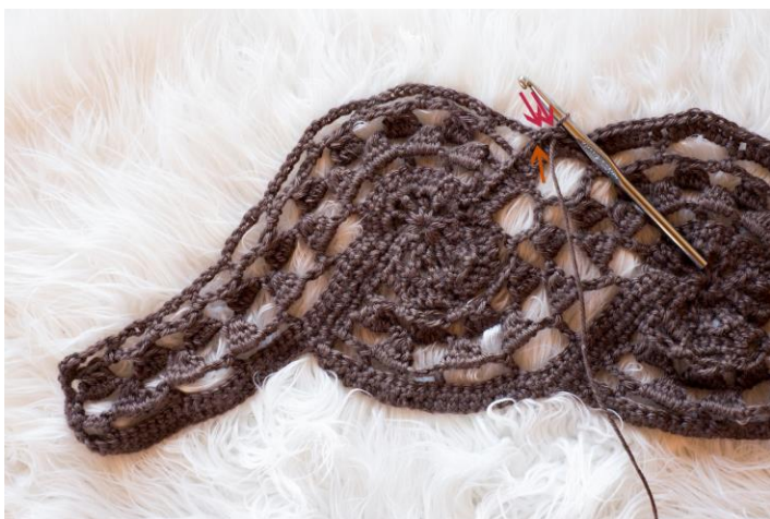
Photo 13: Row 6 completed. Note the slip stitch into edge of prior shell (orange arrow), plus two more slip sts at end of row (red arrows).