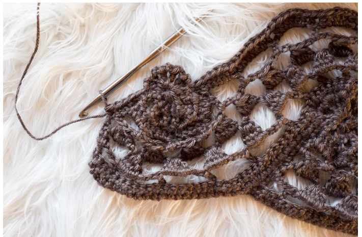
Photo 6: Single crochet 12 sts into the edge of the previous shell sequence in the middle part of Row 1.