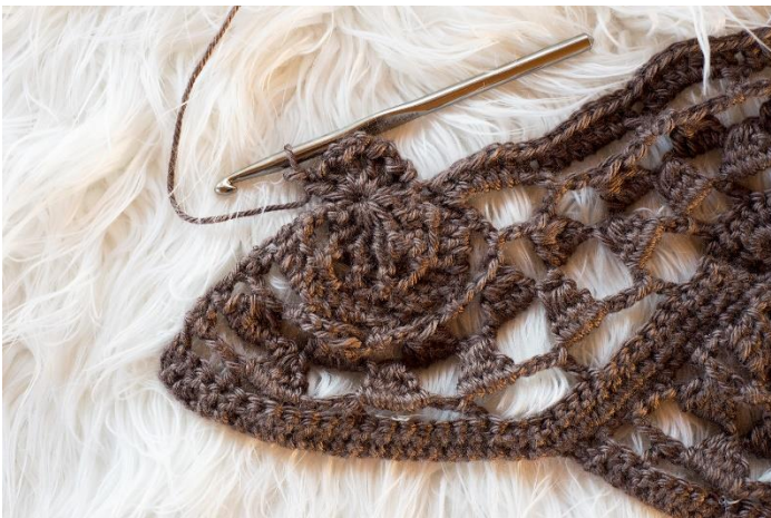
Photo 5: Turn work and do first repeat section between ** of Row 1.